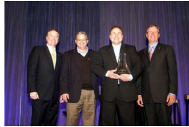
Leaders from Veyance Technologies and Polk

Automotive Parts Headquarters, Inc. was recognized by Polk in the Retailer/ Distributor category. As a family- and employee-owned business, the St. Cloud, Minn.-based aftermarket auto parts distributor and store group implemented a unique twist on time-tested inventory management practices that helped them stand out among other nominees. The organization's focus was on improving customer service while increasing inventory efficiency. They strived to have the right inventory in their 110 locations, not just the right dollar amount of inventory. As part of this process, they built their