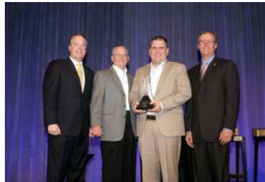
Leaders from APH and Polk

CounterLogic database that allows their inventory management system to know which products are required for specific repairs – ensuring all are items on hand when needed.